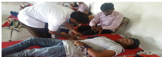
Under SP Pune University NSS unit of ATSS CBSCA College blood donation camp

Under SP Pune University NSS unit of ATSS CBSCA college blood donation & health checkup camp was organized on 13 th Aug 2018. Around 185 staff and students had shown their interest for the blood donation camp. Total 35 eligible donors have donated their blood towards contribution to social cause.