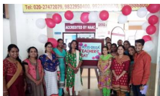
Teacher's Day Celebration

Fresher's party for new comers batch 2018-2021 was organized on 4 th August 2017. Fresher's Day was celebrated to welcome first year students. The program was organized by SY & TY students under ARKO Club. Welfare for last year students was organized by SY and FY students on 11 th April 2019.