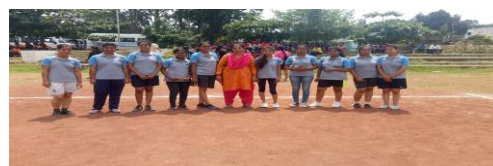
Inter College Volyball Competition