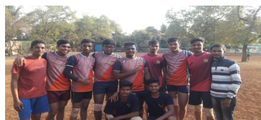
Kabbaddi Winner Moraya Youth Festival